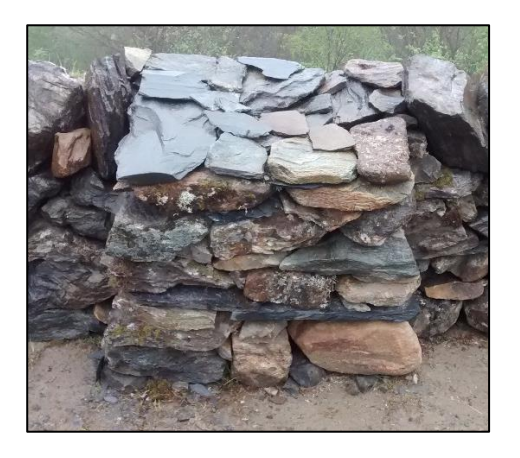
Plinth for 'Interpretation Board'

To complete the project, we now need to design and add an 'Interpretation Board' to the plinth in the viewpoint wall. Funding for this vital final element is currently under consideration.