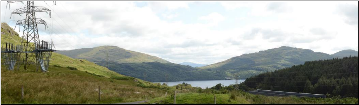
Glen Sloy track: photograph (as now)

The glen is a popular walking route, giving access from the car park at Inveruglas up towards the summits of Ben Vane and Beinn Narnain. Cumulatively these overhead lines dominate the lower part of the glen, and substantially detract from the scenic qualities of the landscape.