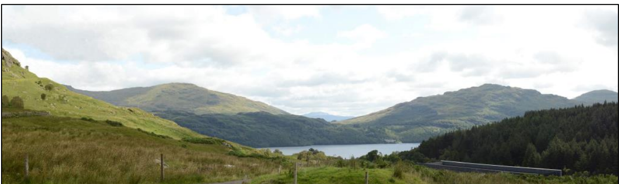
Glen Sloy track: visualisation (as proposed)

The proposals will enhance the character and special qualities of Glen Sloy within the National Park, and have been designed to benefit the maximum number of people, by focusing on a well visited part of the National Park. This will enhance the enjoyment of the landscape and its scenic views, for many people who visit the area.